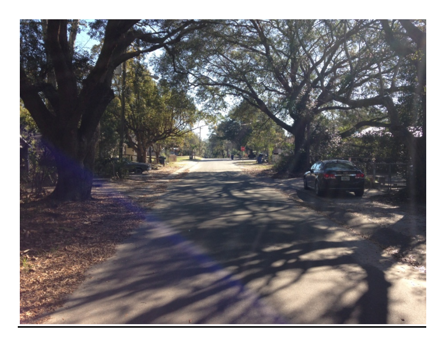
Street View – East