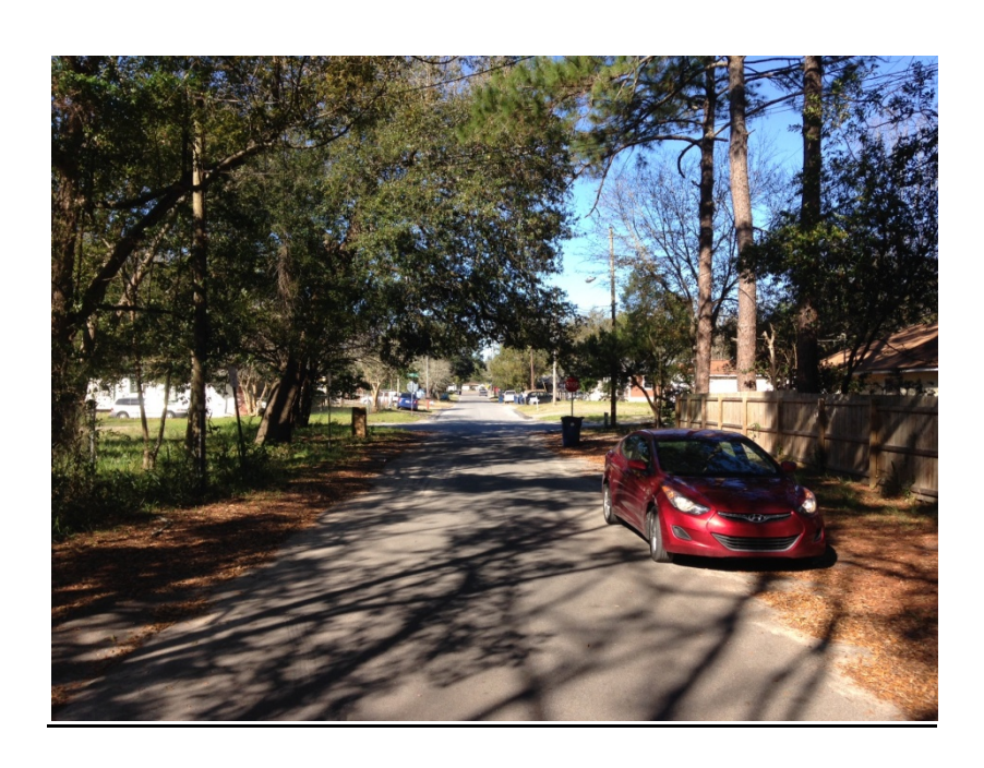
Street View – West